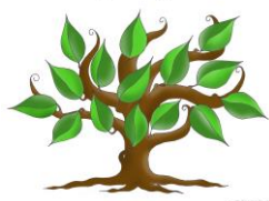
My Family Tree

Art Class for Kids will be held on Thursday, May 17th from 3:45-4:45 PM in the William Udicious Pavilion. Children ages 6-10 will have great time learning about geometric shapes! There will be games, drawing and slime. Students will create a drawing based on their slime's contour lines, and each child will get to take home some slime! Please register your child in advance for a spot.